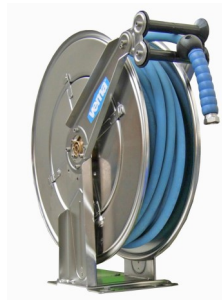
S/s automatic hose reel (Without hose) Code 10300 (Section 50)