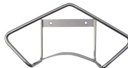
S/s wall holder for hose Code 20903