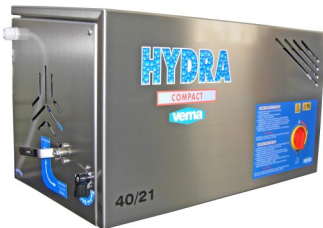
Wall mounted version