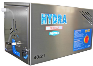
Wall mounted version