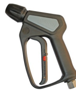
Gun with pin Ø 14 Code 25095/ST