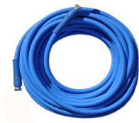
H.p. hose. R/2 L= 15mt. Crimped 3/8" female zinc. Code 18215